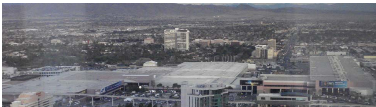
Aerial view of convention center

The 2010 Consumer Electronics Show (CES) has wrapped up and as we have for over the past 16 years ClaimControl was there again with 120,000 of our closest friends to cover every inch of the show to ensure that you have access to the most up to date product information and technology trends. So just how big was CES this year? How about over 2500 exhibitors, covering more than 1.7 million square feet or about 35 football fields of display space.